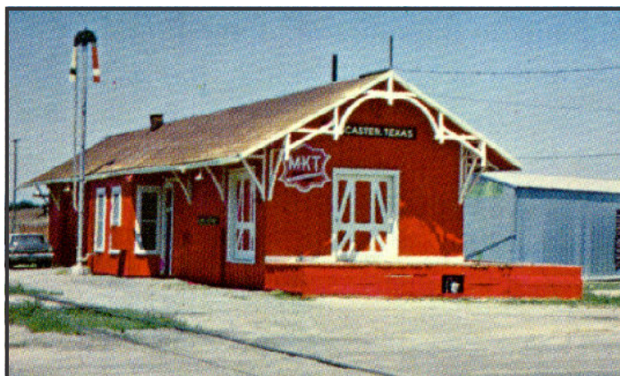
MKT Depot as it looked when it was in use as a train depot.