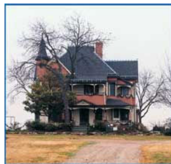
The W. A. Strain House was built in 1896 and is listed on the National Register of Historic Places.